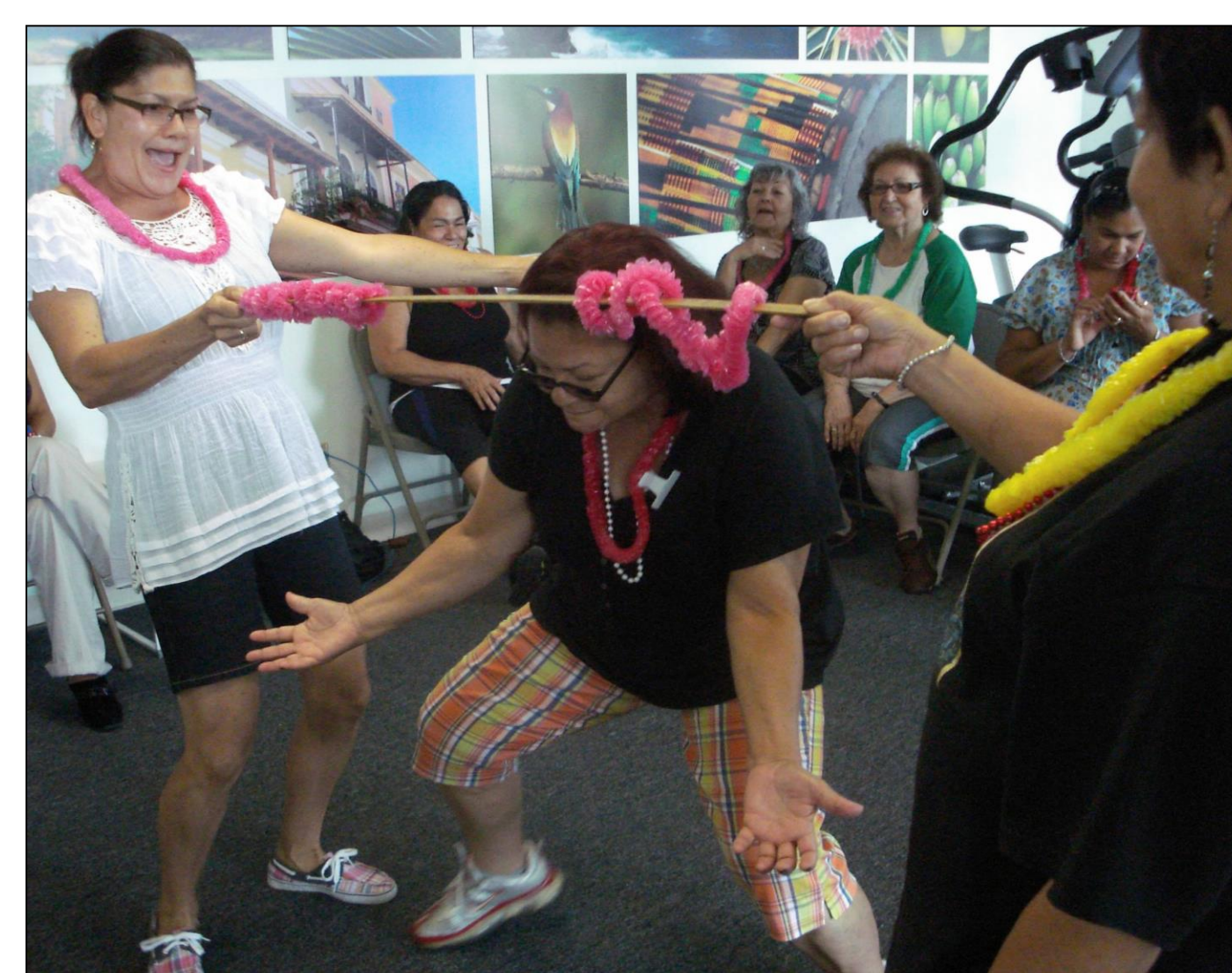
CRI Life Enhancement Program participants are offered regular post-graduation reunions and take part in food demonstrations.

This formative research also informs the selection and training of interdisciplinary teams of health care professionals drawn primarily from the health care partner's staff. These teams provide participants at least 40 hours of community-based participatory and hands-on group sessions (in English or in Spanish), fitness instruction, live cooking demonstrations, social support, nutritionist-guided grocery store trips, and hour-long one-on-one consultations with each core team specialist.