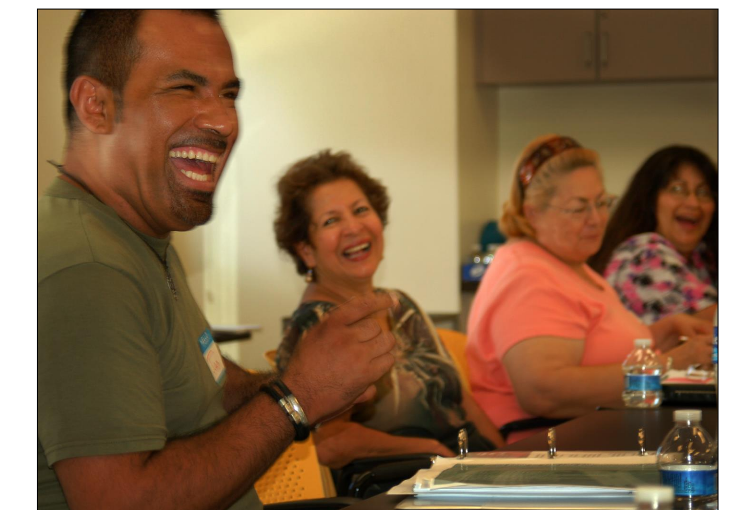
Important components of the CRI Life Enhancement Program are opportunities for regular fitness activities and group support.